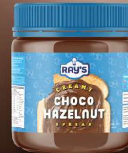
Creamy Choco Hazelnut Spread