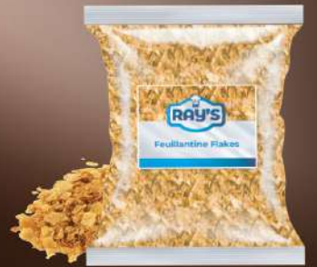
Feillantine wafer flakes