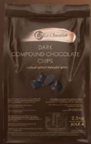
Dark compound chips