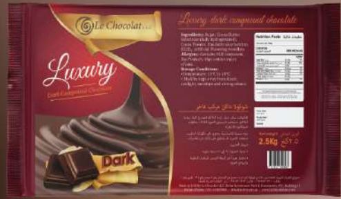
Dark Luxury Compound Chocolate