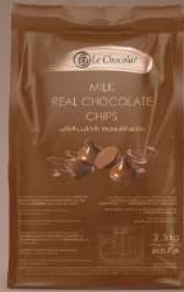
Real Milk chips