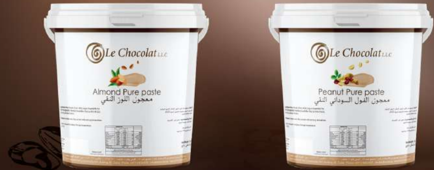
Almond Pure Paste