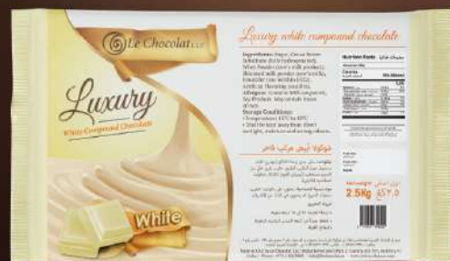
White Luxury Compound Chocolate