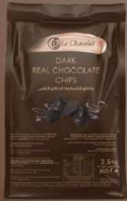
Real Dark chips