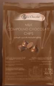
Milk compound chips