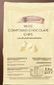
White compound chips