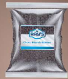
Dark Cookie brittles