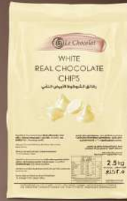
Real White chips