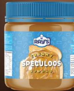
Creamy Speculoos Spread