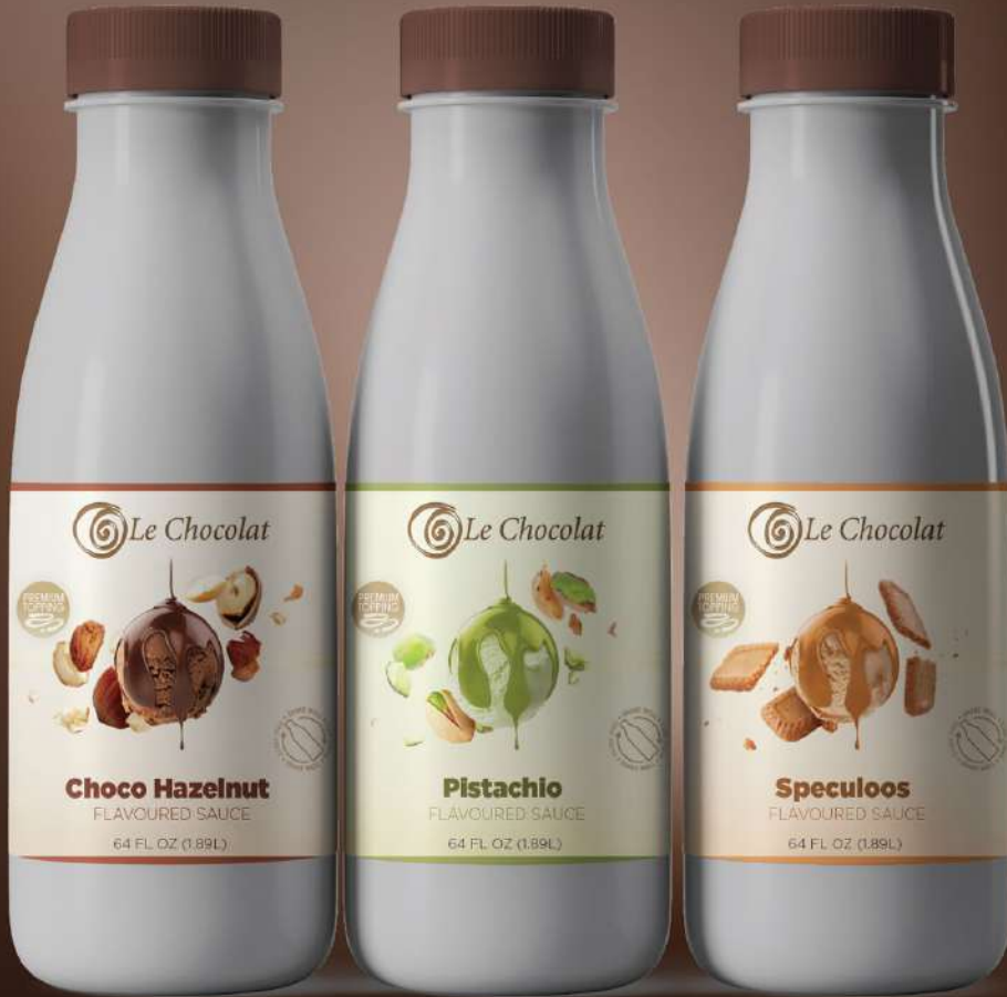
Choco Hazelnut FLAVOURED SAUCE