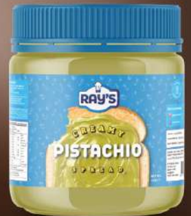
Creamy Pistachio Spread