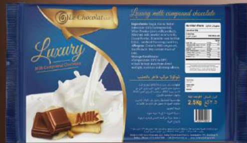
Milk Luxury Compound Chocolate